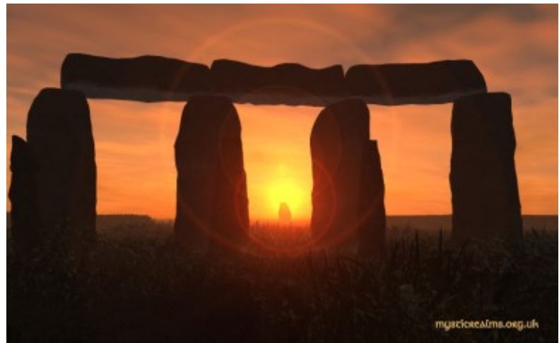
Stonehenge at the Summer Solstice